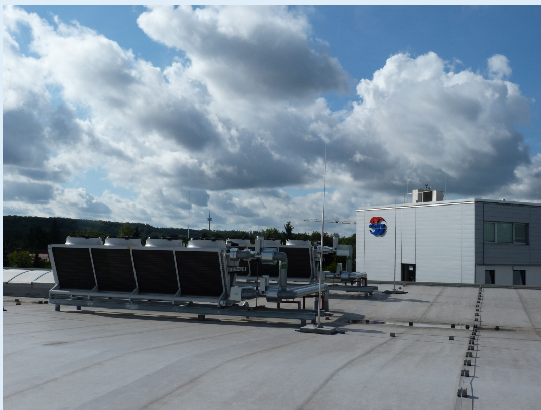
The installed drycoolers are from Güntner's GFW series.

The air-conditioning in Güntner's new server room, which was completed at the end of last year, uses our own highly energy-efficient equipment. Since the company's continual growth had already exhausted the capacity of their existing infrastructure, it had become necessary to set up a completely new data centre at the company's headquarters in Fürstfeldbruck. Alongside the new installations it was also planned to expand the existing capacity for emergency power supplies and air conditioning to meet Güntner's growing demands.